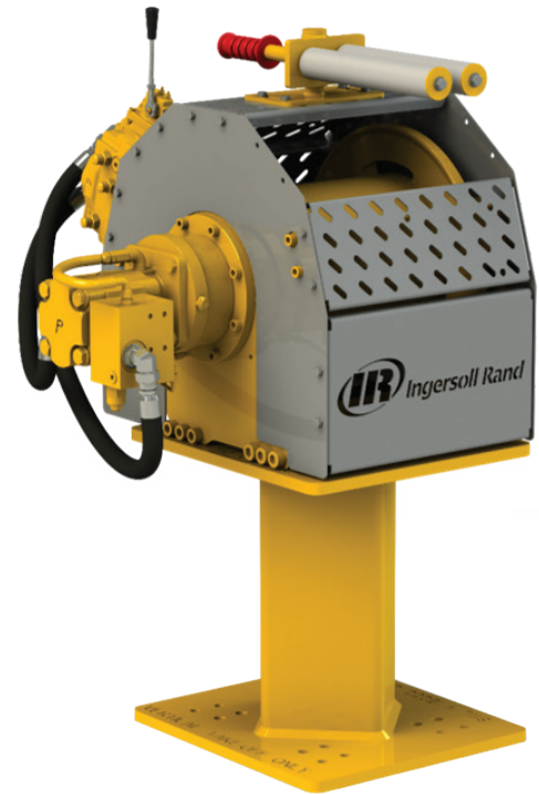
12,000 lb Hydraulic Force Series™ utility winch (HF12) with local controls and all accessories

For decades, businesses have trusted Ingersoll Rand® to provide safe and reliable material handling solutions. The Hydraulic Force Series™ is just the next step in helping you reach your goals.